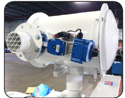
COMBO VACUUM FILTER RELIEF CANISTER