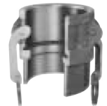
SOCKET WELD SHOWN

Available in 8" and 10" sizes. Please call for more information. * 3" and 4" aluminum have machined shanks.