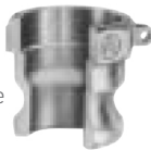
SOCKET WELD SHOWN

Available in 8" and 10" sizes. Please call for more information.