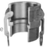
SOCKET WELD SHOWN

Available in 8" and 10" sizes. Please call for more information.