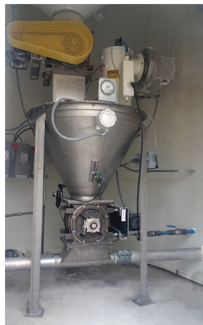
PNEUMATIC CONVEYING SYSTEM

VISIT WWW.CAMCORPINC.COM AND VIEW A VARIETY OF FOOD PROCESSING SYSTEMS DESIGNED BY CAMCORP.